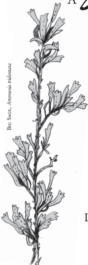
Big Sage, Arenesia tridentata